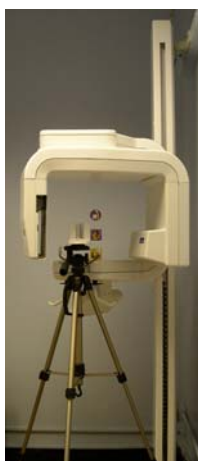
Panoramic Test Object in situ