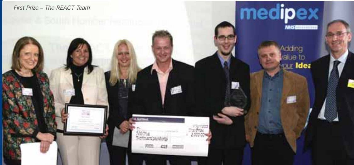
First Prize – The REACT Team