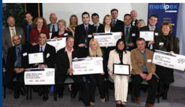
Award winners celebrate their outstanding achievements

Staff from across the region's NHS organisations showed their natural entrepreneurial potential at the Medipex Innovation Competition 2005 award ceremony, which was held in April at the Thackray Medical museum, Leeds.