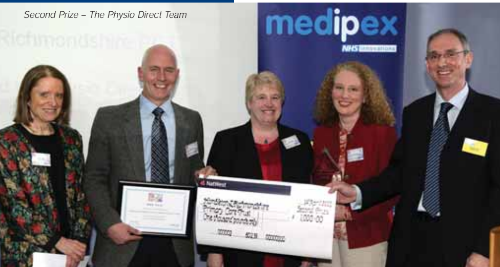
Second Prize – The Physio Direct Team